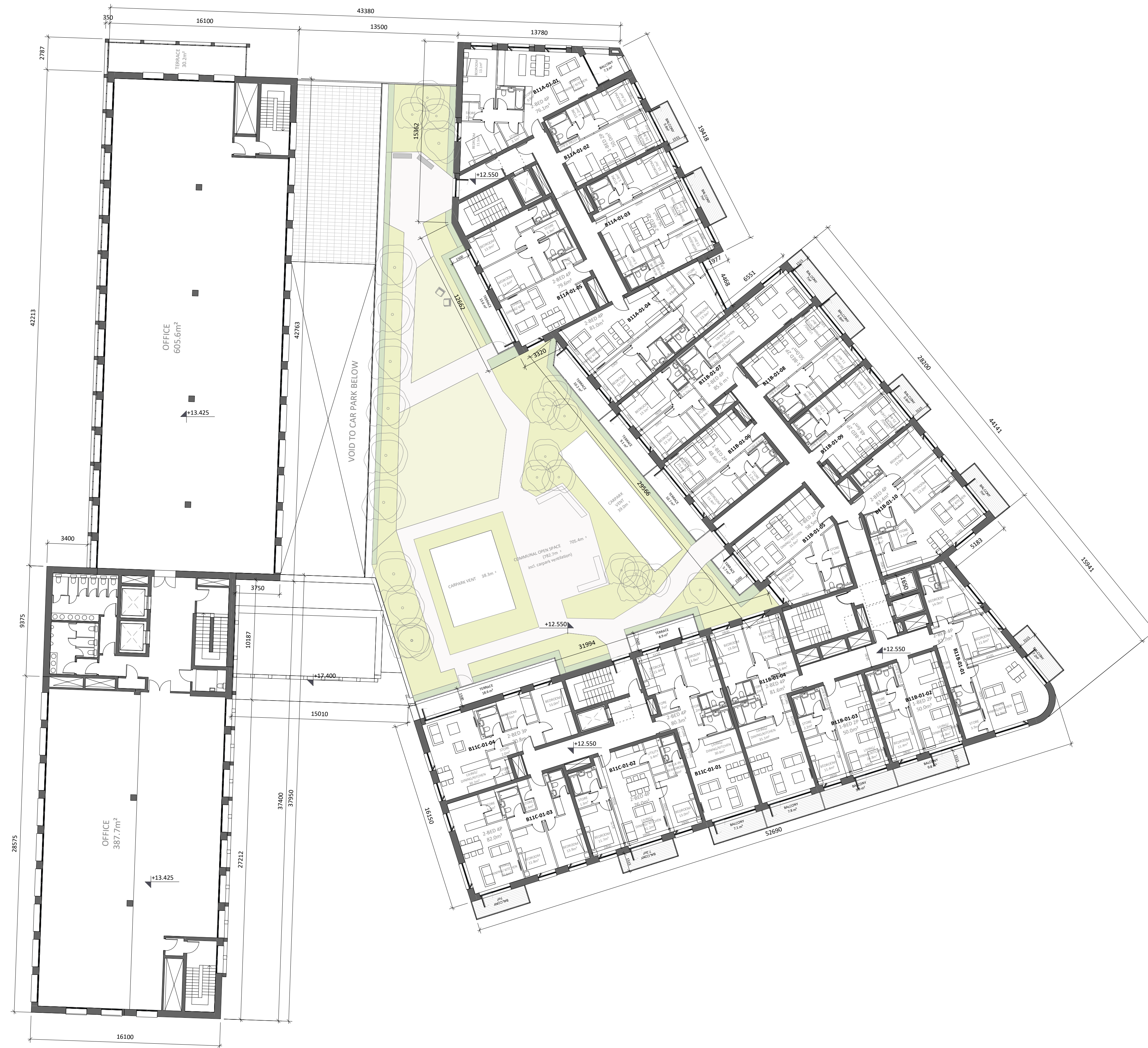
BLOCK 12 LEVEL 01